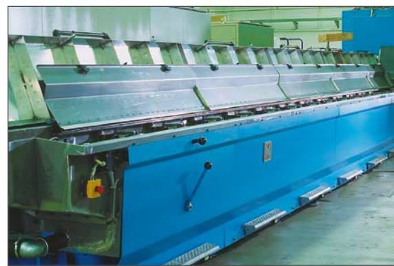
Example for a reconditioned rod breakdown machine type M 85