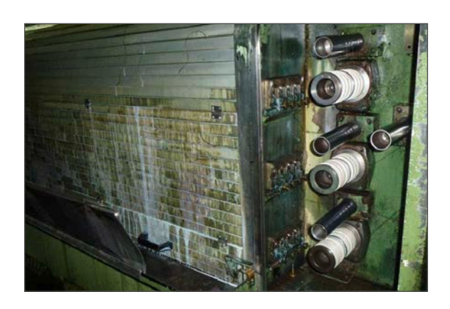
Multiwire drawing machine type MMH before being reconditioned by NIEHOFF

In many cases the modernization of a machine will come into consideration if the drive technology is defective and certain components, for example three-phase power controllers or converters, are no longer available. In these cases, it also makes sense to equip a machine with new AC motors, which are maintenance-free and work more energy-efficiently than the former DC motors.