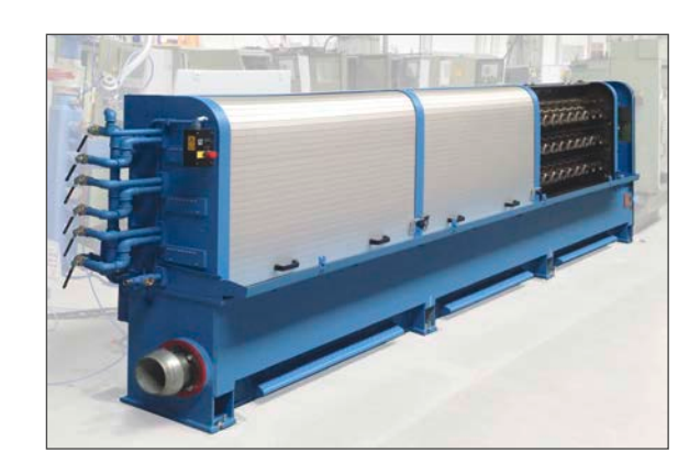
Example for a modernized multiwire drawing machine type MMH

A further measure is to modernize the control system, to install new control panels which allow an intuitive operation, and to update the control software. Sometimes it is also recommended to modify the control cabinet and to equip it with a stronger cool-fan, for example. For the users of NIEHOFF systems it is advantageous that NIEHOFF develops in-house all kinds of electronic controls. These controls are ideally adapted to the individual applications and help to optimize manufacturing processes and to reduce costs. One example in this context is the NIEHOFF Annealing Controller (NAC) for continuous resistance annealers.