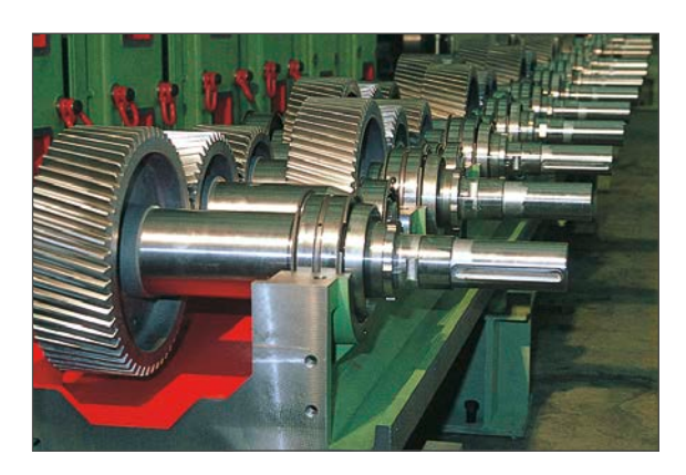
Reconditioned gear of a rod breakdown machine type M 85