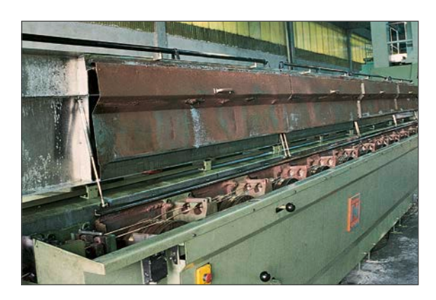
Rod breakdown machine type M 85 before being reconditioned by NIEHOFF

Machines which have been modernized in such a way are not only as good as new, but often reach an even higher level of productivity than before. Therefore, it is worthwhile to subject NIEHOFF machines to a general reconditioning even after decades of use to put them into tip-top condition again.