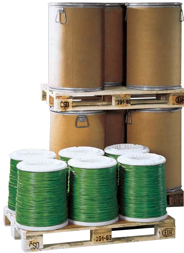
NPS NIEHOFF NPS Spools