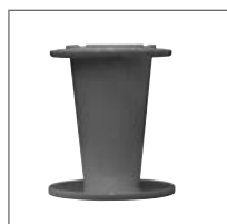
NPS 400/400 PP