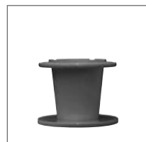
NPS 400/250 PP