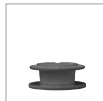
NPS 400/100 PP