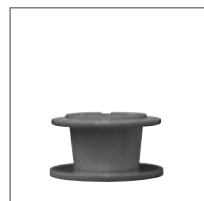
NPS 400/150 PP