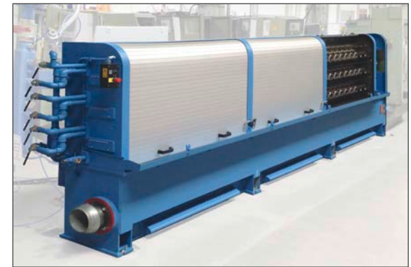
Example for a modernized multiwire drawing machine type MMH

A further measure is to modernize the control system, to install new control panels which allow an intuitive operation, and to update the control software. Sometimes it is also recommended to modify the control cabinet and to equip it with a stronger cool-fan, for example. For the users of NIEHOFF systems it is advantageous that NIEHOFF develops in-house all kinds of electronic controls. These controls are ideally adapted to the individual applications and help to optimize manufacturing processes and to reduce costs. One example in this context is the NIEHOFF Annealing Controller (NAC) for continuous resistance annealers.