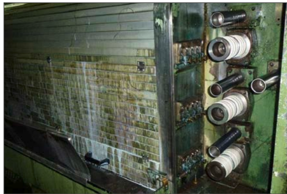
Multiwire drawing machine type MMH before being reconditioned by NIEHOFF

In many cases the modernization of a machine will come into consideration if the drive technology is defective and certain components, for example three-phase power controllers or converters, are no longer available. In these cases, it also makes sense to equip a machine with new AC motors, which are maintenance-free and work more energy-efficiently than the former DC motors.