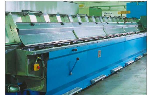
Example for a reconditioned rod breakdown machine type M 85

Machines which have been modernized in such a way are not only as good as new, but often reach an even higher level of productivity than before. Therefore, it is worthwhile to subject NIEHOFF machines to a general reconditioning even after decades of use to put them into tip-top condition again.