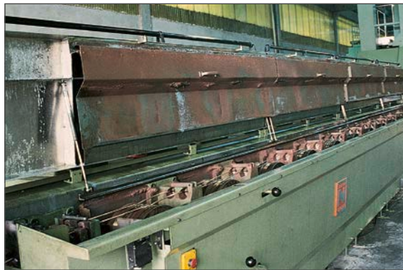
Rod breakdown machine type M 85 before being reconditioned by NIEHOFF

When planning a modernization project, first NIEHOFF technicians inspect the machine or line in question at its place of operation and draw up a quotation. The reconditioning of rod breakdown lines and smaller stand-alone machines like spoolers and bunchers is usually performed at their operation site. Multiwire drawing lines can also be reconditioned at the customer's facility without any problems or are modernized in the large workshop halls at the NIEHOFF headquarters or at one of the subsidiaries with an own production facility.